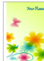
7. Bright Flowers